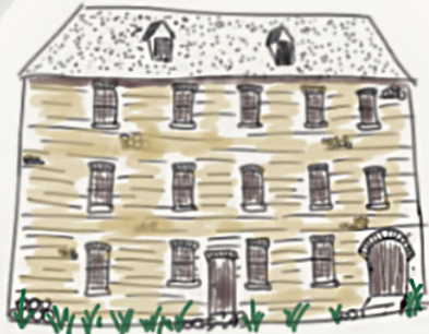
DANIEL MCMILLAN'S GRIST MILL First built in 1849, the mill was rebuilt twice after fires, and is now being converted into a library.

EASTERN WHITE CEDAR Historically, Vitamin C-rich Thuja occidentalis was used to wash wounds and treat fungal skin irritations.